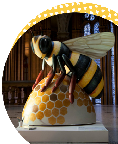
Bee (in progress) by artist Jodie Silverman: Bee in the City

Manchester will be transformed into a city-wide, immensely popular, free art event which will ultimately bring significant social and economic benefits to the city and the region.